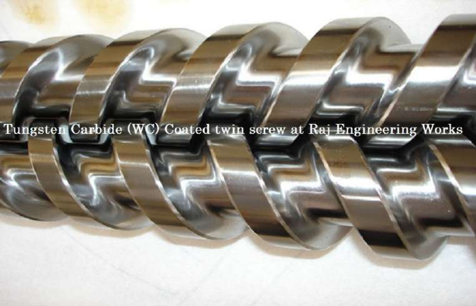
Tungsten Carbide (WC) Coated twin screw at Raj Engineering Works